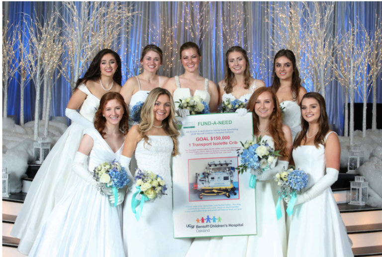
2018 Winter Ball Debutantes